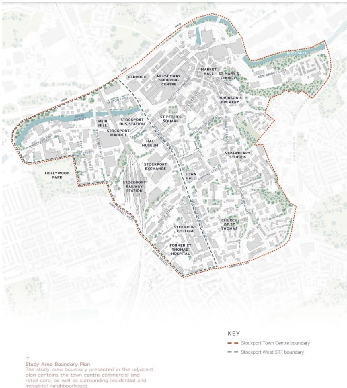
Figure 1. Map of the Stockport Town Centre area as defined in the Stockport Town Centre Residential Design Guide